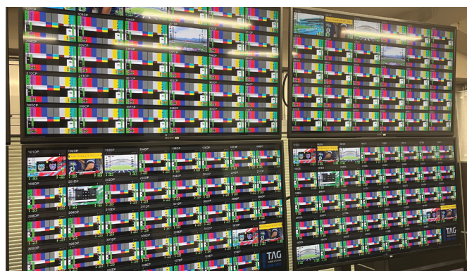
MCM-9000's penalty box function displays an alert (yellow bar) on streams where an error is detected.

Responding to the growing needs for video and streaming content, Nexion began considering a new transmission project during the summer of 2022. The project encompassed monitoring over 100 channels of video from various sports event venues through the TNOC and transmitting them to multiple distribution platforms via IP—a largescale endeavor. Accustomed to monitoring with SDI, the task of converting to IP workflows and the associated costs presented a significant challenge.